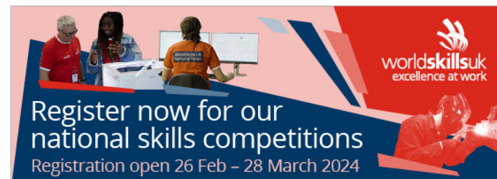
email banner 564x200