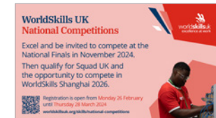
digital screens 1920x1080