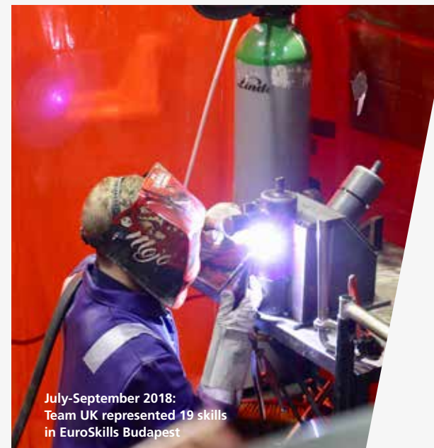
July-September 2018: Team UK represented 19 skills in EuroSkills Budapest