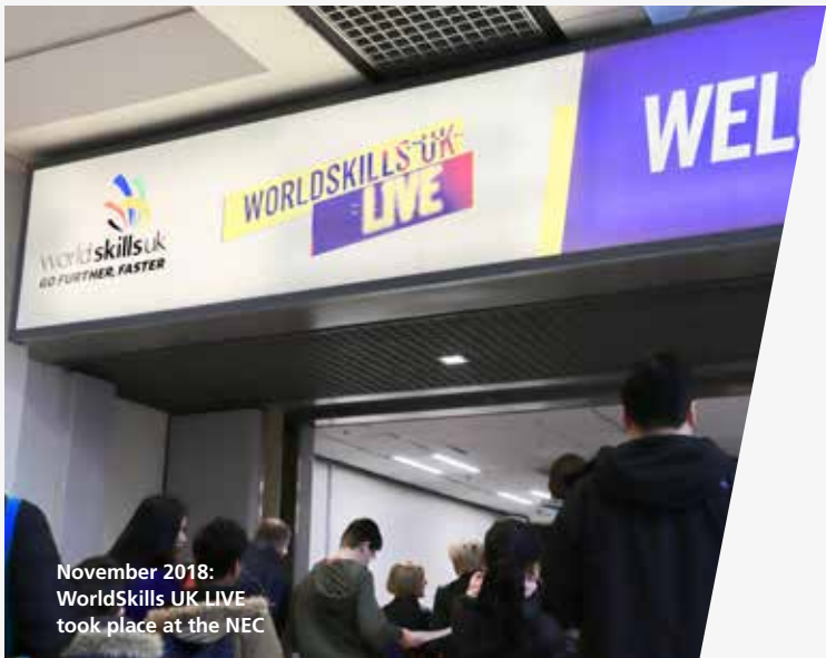
November 2018: WorldSkills UK LIVE took place at the NEC