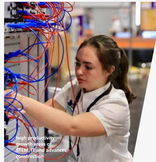
High productivity growth areas of STEM, IT and advanced construction