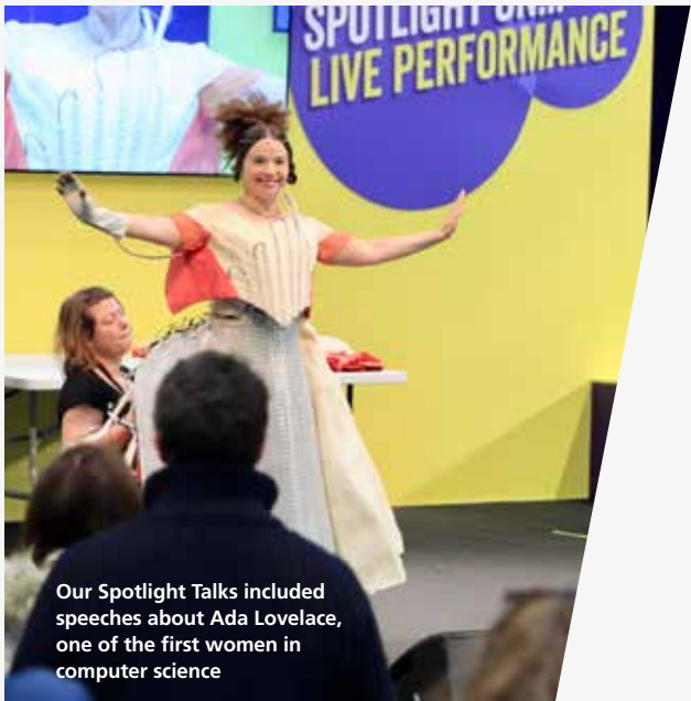
Our Spotlight Talks included speeches about Ada Lovelace, one of the first women in computer science