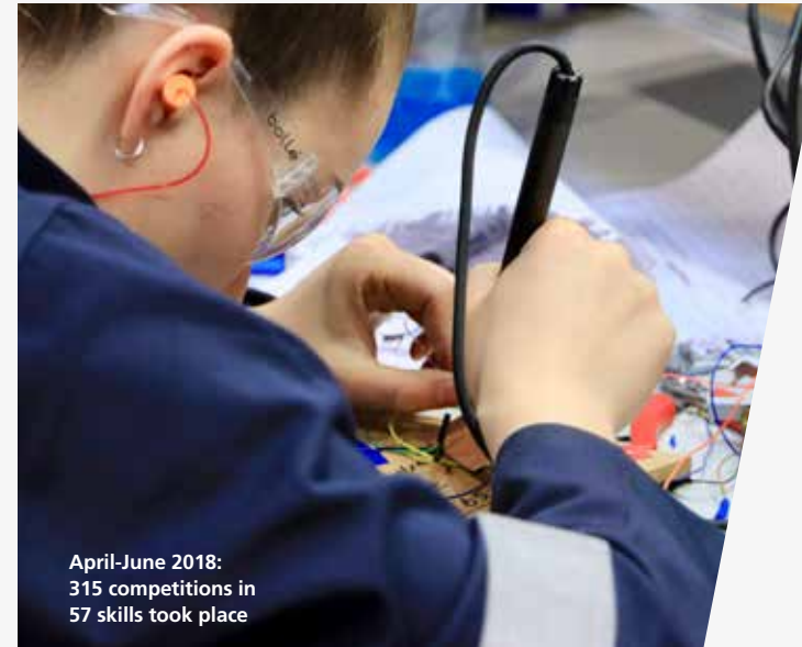
April-June 2018: 315 competitions in 57 skills took place