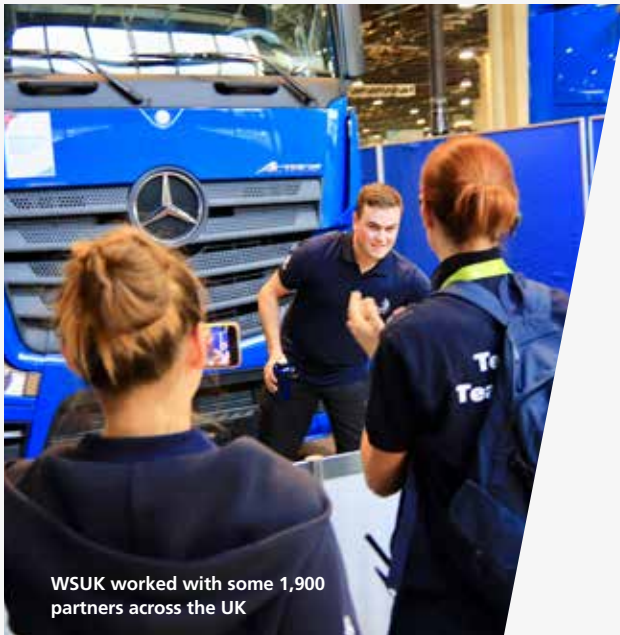
WSUK worked with some 1,900 partners across the UK