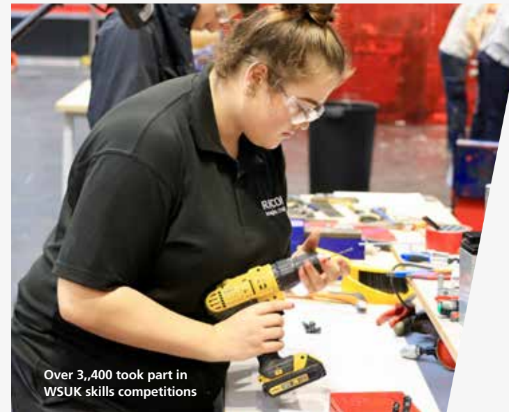
Over 3,400 took part in WSUK skills competitions