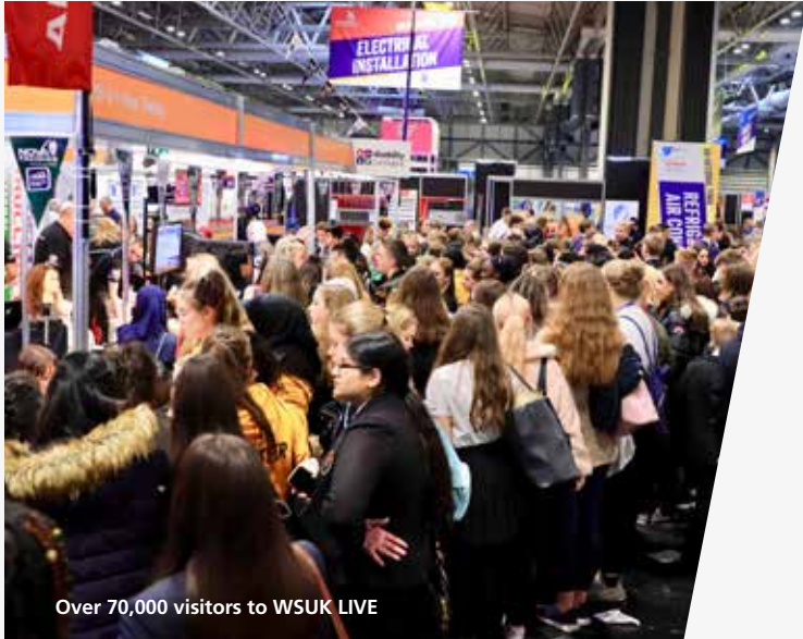
Over 70,000 visitors to WSUK LIVE